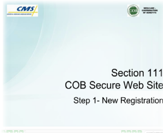
COBSW-Step 1-New Registration CBT presentation

If you have questions about logging in to the CMS CBT website, please send an email message to techi@nhassociates.net .